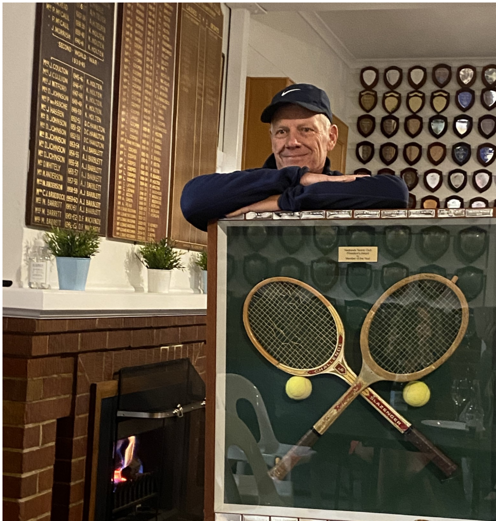
(Disclaimer: Editor bias)