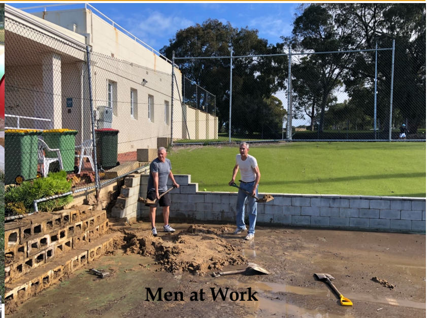
Men at Work