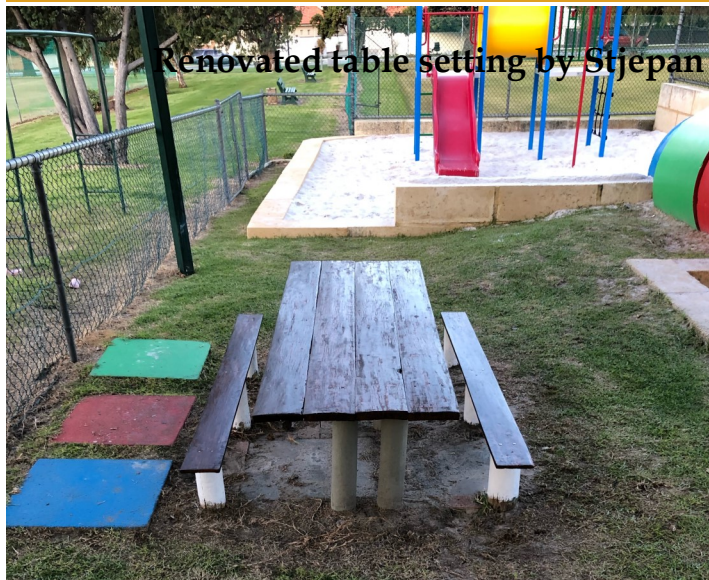
Renovated table setting by Stjepan